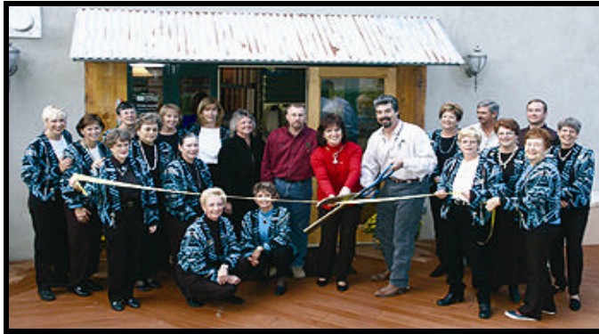
RIBBON CUTTING AT THE NEW FOXWORTH-GALBRAITH HOME DESIGN CENTER IN THE ATTIC COMPLEX