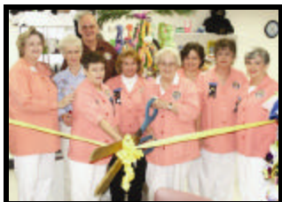
GIFTS & GAB LCMC AUXILIARY