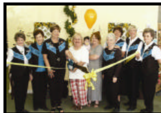
SUNFLOWER FLORAL & GIFTS AT MECHEM & SUDDERTH