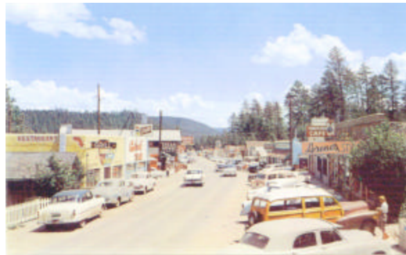
How Things Have Changed!

Join the tourists and shop locally this season.